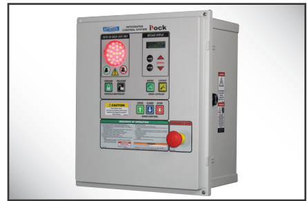
Optional iDock® Controls offer enhanced operation and an interactive message display with equipment information.